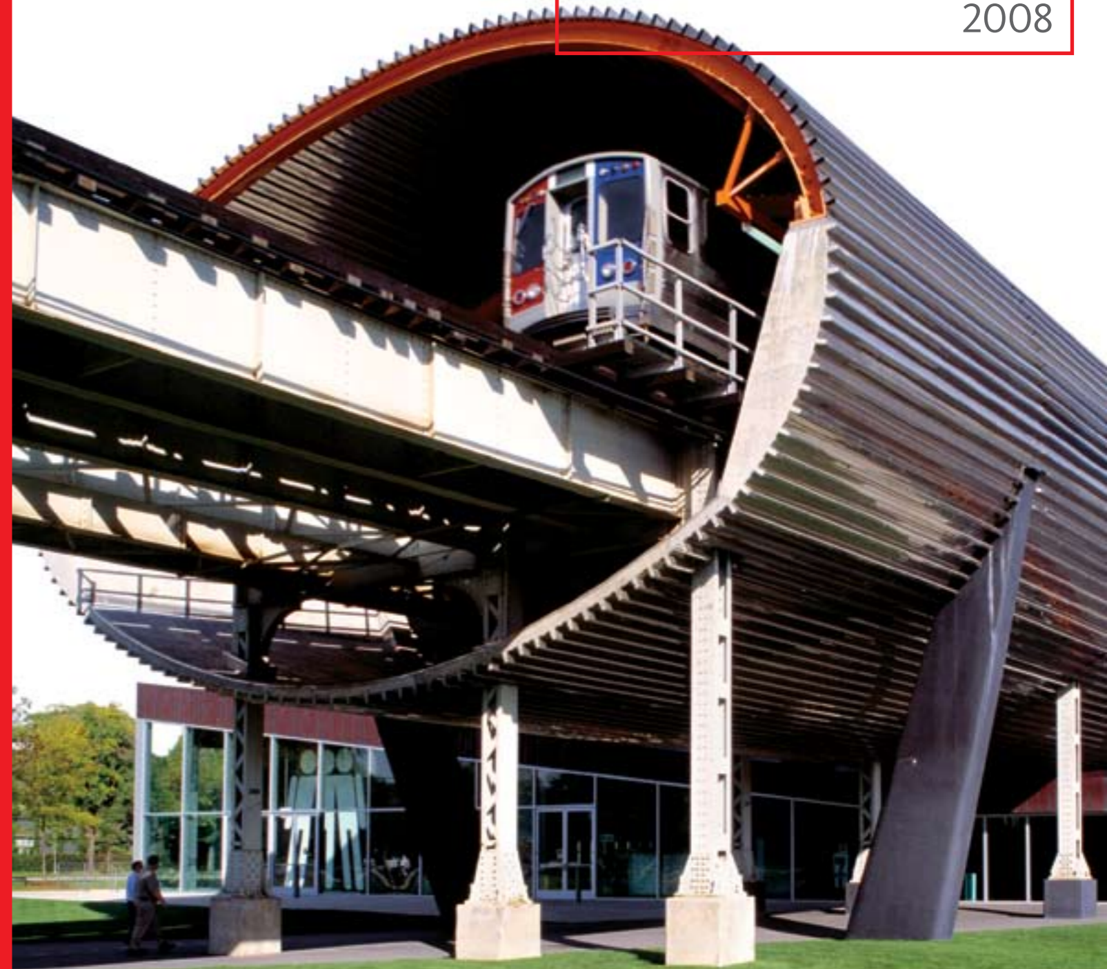
Cover Image: McCormick Tribune Campus Center, architectural design by OMA.

To learn more, visit www.autodesk.co.uk/autocad .